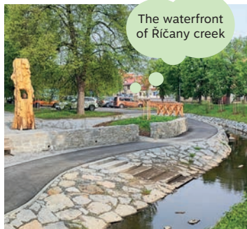
The waterfront of Říčany creek