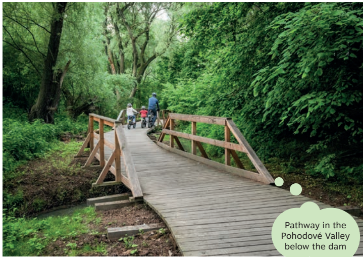
Pathway in the Pohodové Valley below the dam