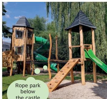
Rope park below the castle