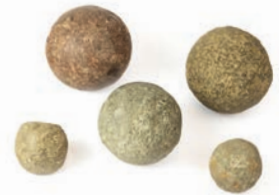
Cannonballs from the conquest of Říčany Castle

• Play the geolocation game Treasure Hunt in Medieval Říčany and experience life in the castle and town! Download the Geofun app for free on Google Play or the App Store.